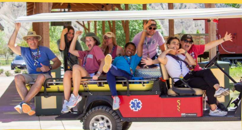
Our 2024 seasonal and full-time medical team!

We are deeply grateful to our medical team and volunteers, whose care and support allowed families to find some much-needed respite this summer.